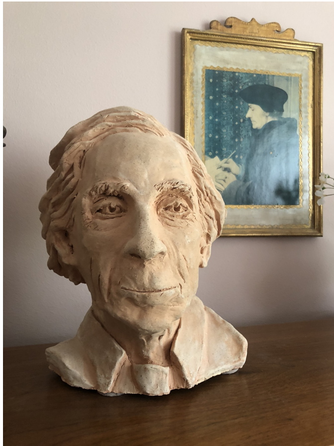
A bust of Bertrand Russell, with Erasmus portrayed in the background painting.