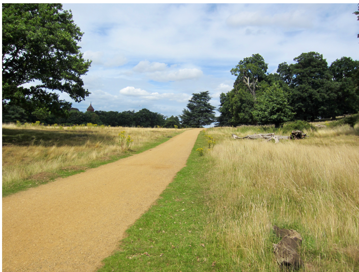
Richmond Park near Petersham

2 In compiling this information, the author has made some use of Max Lankester’s What’s in a Name? Features of Richmond Park (2015), with photographs. See also the Richmond Park Wikipedia article, https://en.wikipedia.org/wiki/Richmond_Park#Buildings .